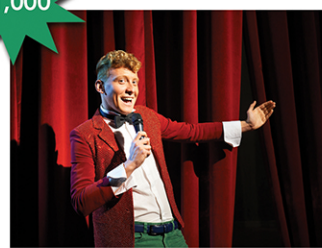
In-house Children's Theater Production