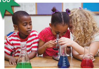
Science Olympiad Entry Fee