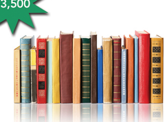
Classroom Novel Sets