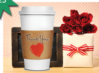
Teacher Appreciation Coffee Cart