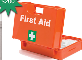
School Nurse Supplies