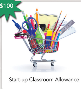
Start-up Classroom Allowance